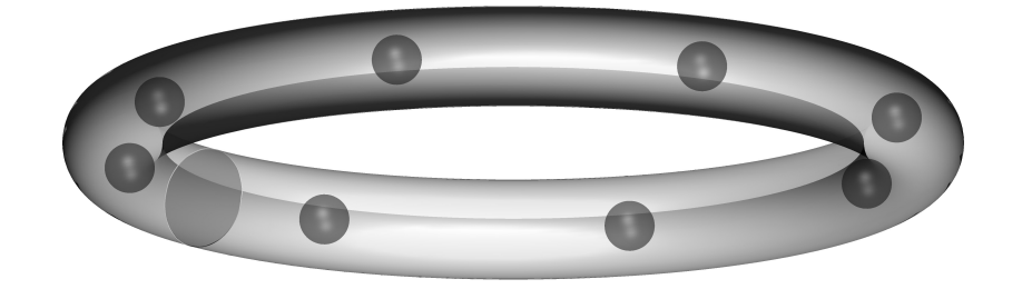
Figure 2: An example of domain which is not simply connected and whose boundary is not connected. The domain is made of the torus without the dark grey inclusions. It is not simply connected because of the toroidal structure. The boundary is not connected because the boundary of the torus and the ones of the spheres are not connected. The grey disk represents a cut \Sigma_1 which is such that \Omega \setminus \Sigma_1 is simply connected.